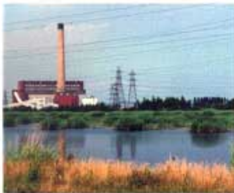
Reedbed creation, Gwent Levels